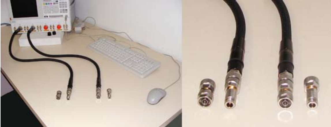
Fig. 2 Test port cables with interchangeable phase equal adapters