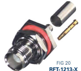
FIG 20 RFT-1213-X