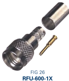
FIG 26 RFU-600-1X