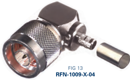
FIG 13 RFN-1009-X-04