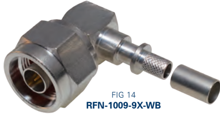
FIG 14 RFN-1009-9X-WB