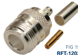
FIG 19 RFT-1203-1X RT-1203-1X