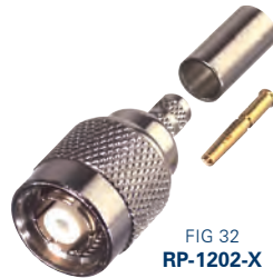
FIG 32 RP-1202-X