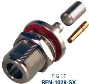
FIG 17 RFN-1029-SX