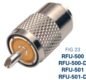
FIG 23 RFU-500 RFU-500-D RFU-501 RFU-501-D