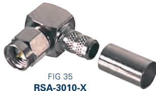
FIG 35 RSA-3010-X