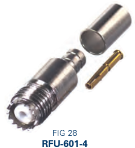
FIG 28 RFU-601-4