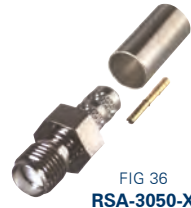
FIG 36 RSA-3050-X