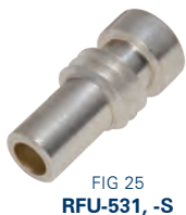
FIG 25 RFU-531, -S