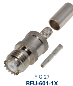
FIG 27 RFU-601-1X