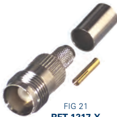
FIG 21 RFT-1217-X