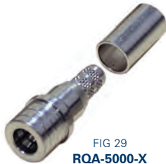
FIG 29 RQA-5000-X