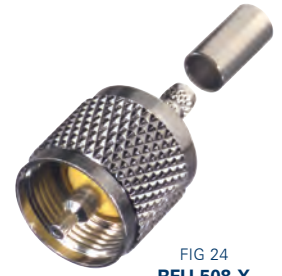
FIG 24 RFU-508-X