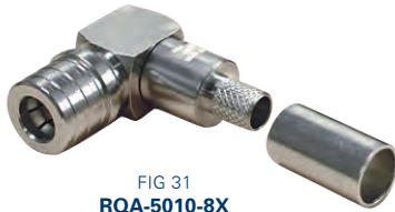
FIG 31 RQA-5010-8X