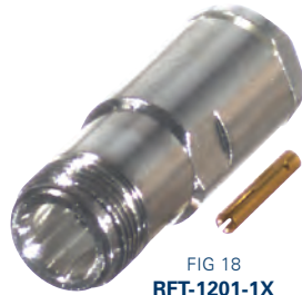
FIG 18 RFT-1201-1X