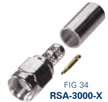
FIG 34 RSA-3000-X