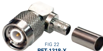
FIG 22 RFT-1218-X