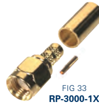
FIG 33 RP-3000-1X