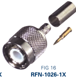
FIG 16 RFN-1026-1X