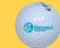
Giveaway items with your company logo.