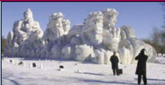
The city of Harbin lies in the center of Manchuria, and embraces its frozen winters by holding an ice festival each year, as it has for the past 27 years. www.talesmag.com