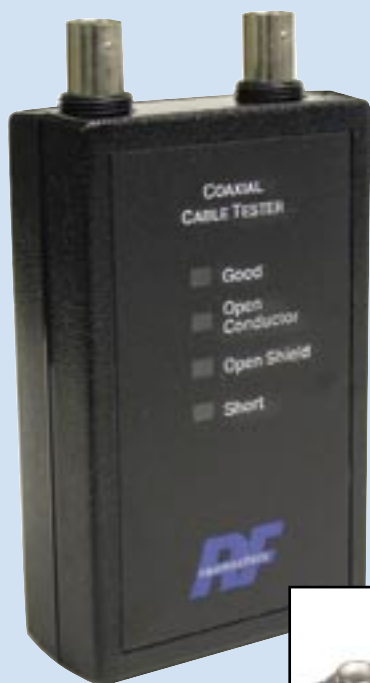
RFA-4017-01 with BNC terminations

W ITH OUR CONVENIENT CABLE TESTERS the bench and field technician can quickly and easily test cables for short, open conductor or open shield, saving precious diagnostic time. The front LED panel indicates pass or fail with a green or red light. Powered by a 9-volt battery, these testers are lightweight, small and completely portable.