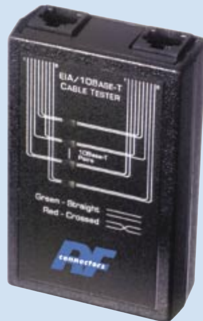
RFA-4218-20 with CAT-5 terminations

Cable testers are available in a variety of kits. Call for details.